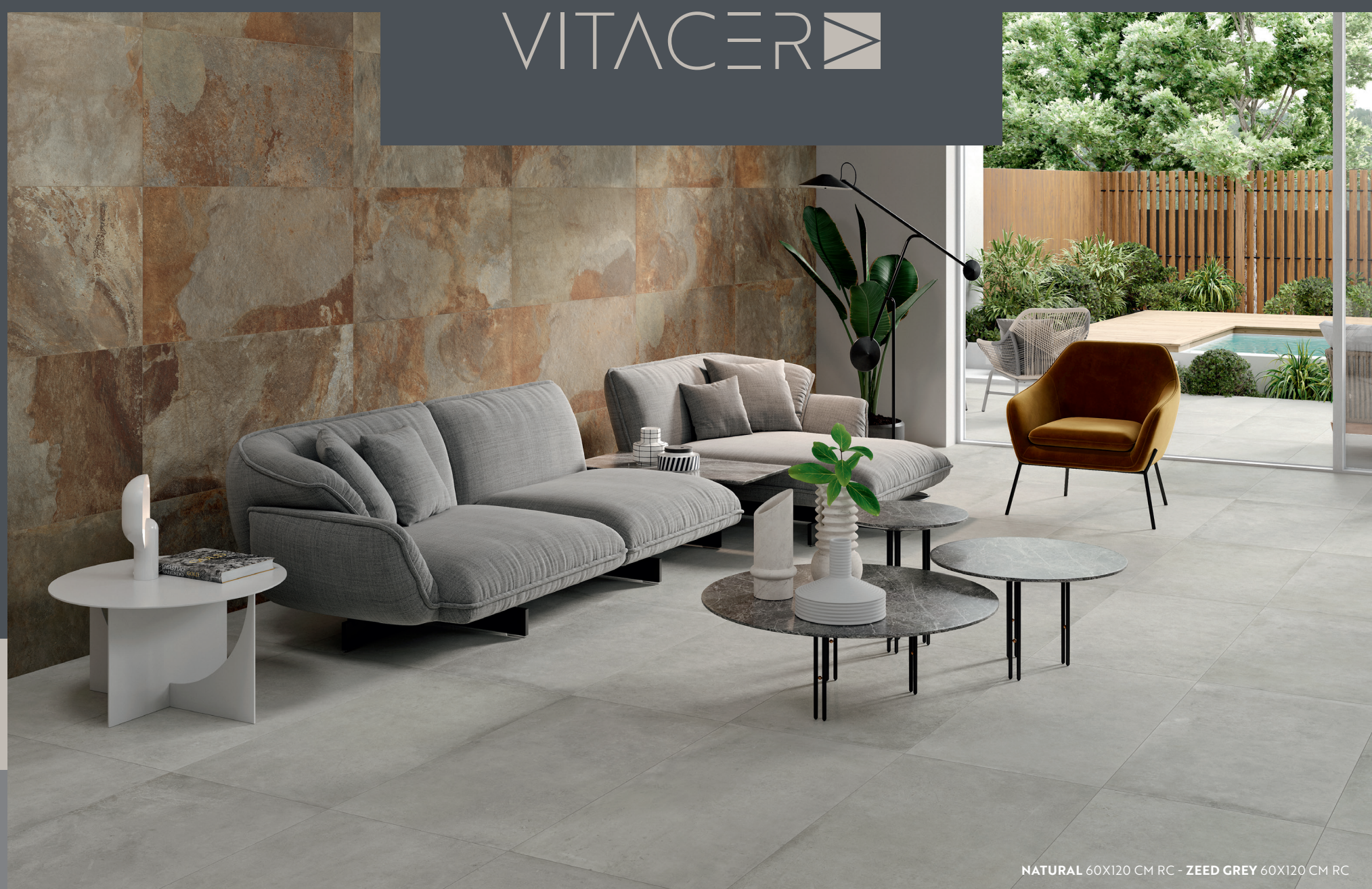
NATURAL 60X120 CM RC - ZEED GREY 60X120 CM RC