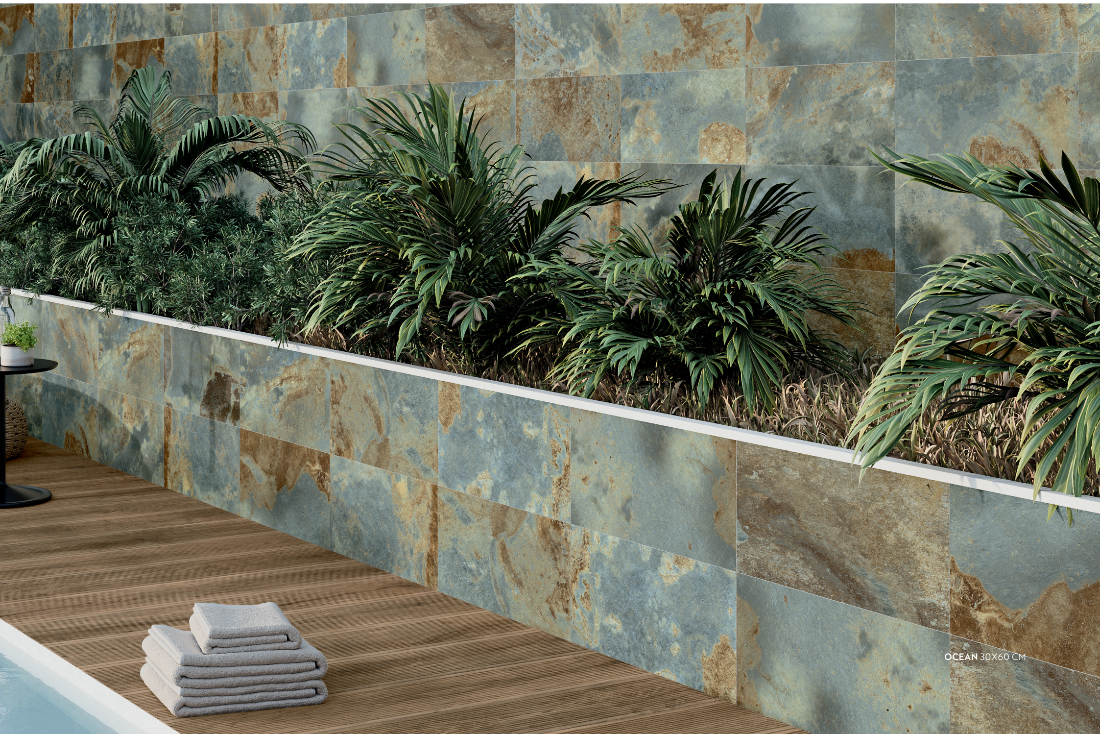
OCEAN 30X60 CM