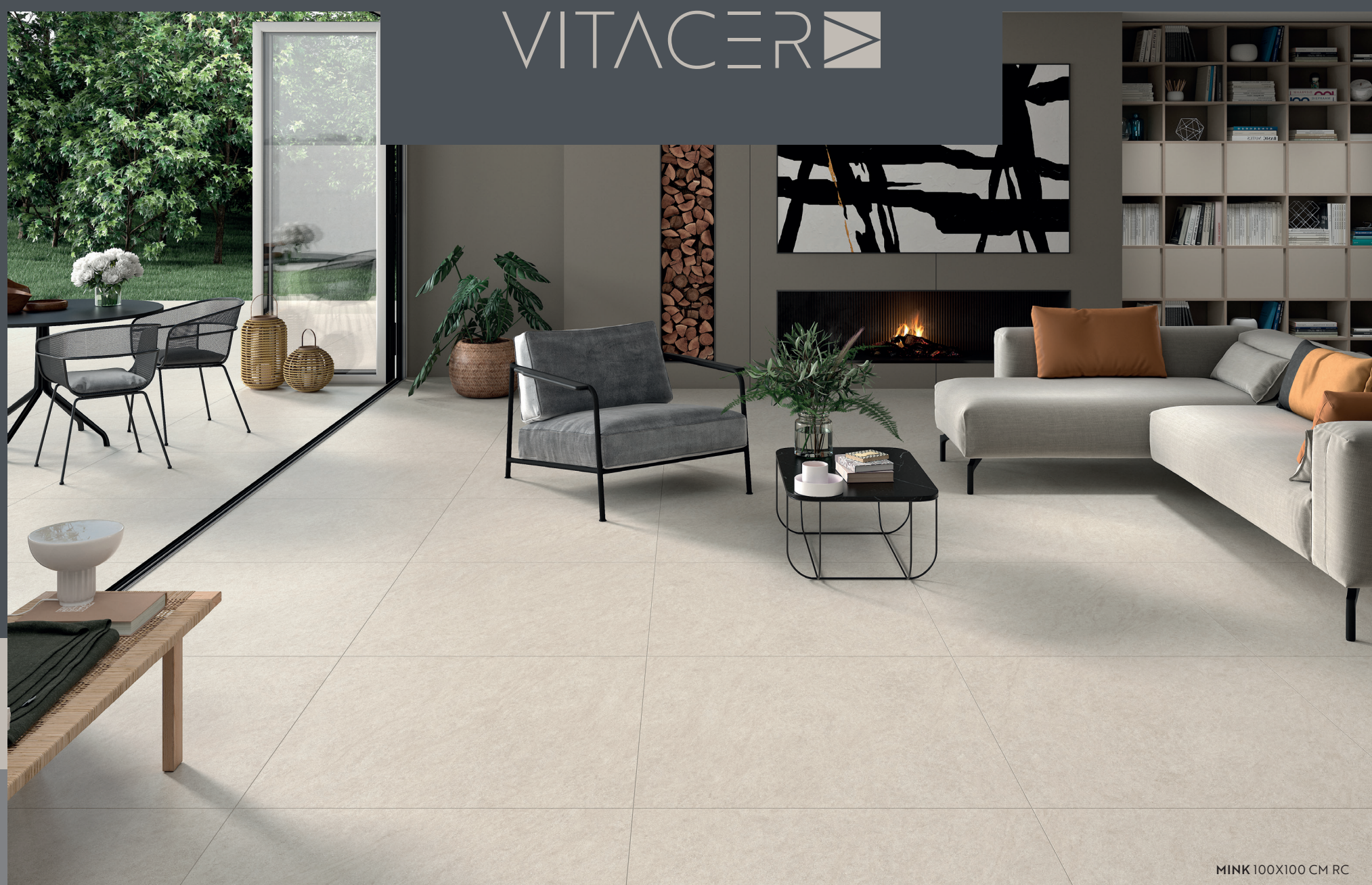
MINK 100X100 CM RC