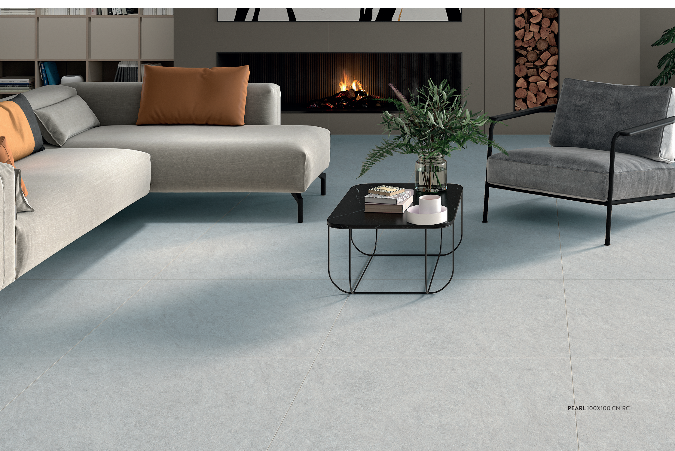
PEARL 100X100 CM RC