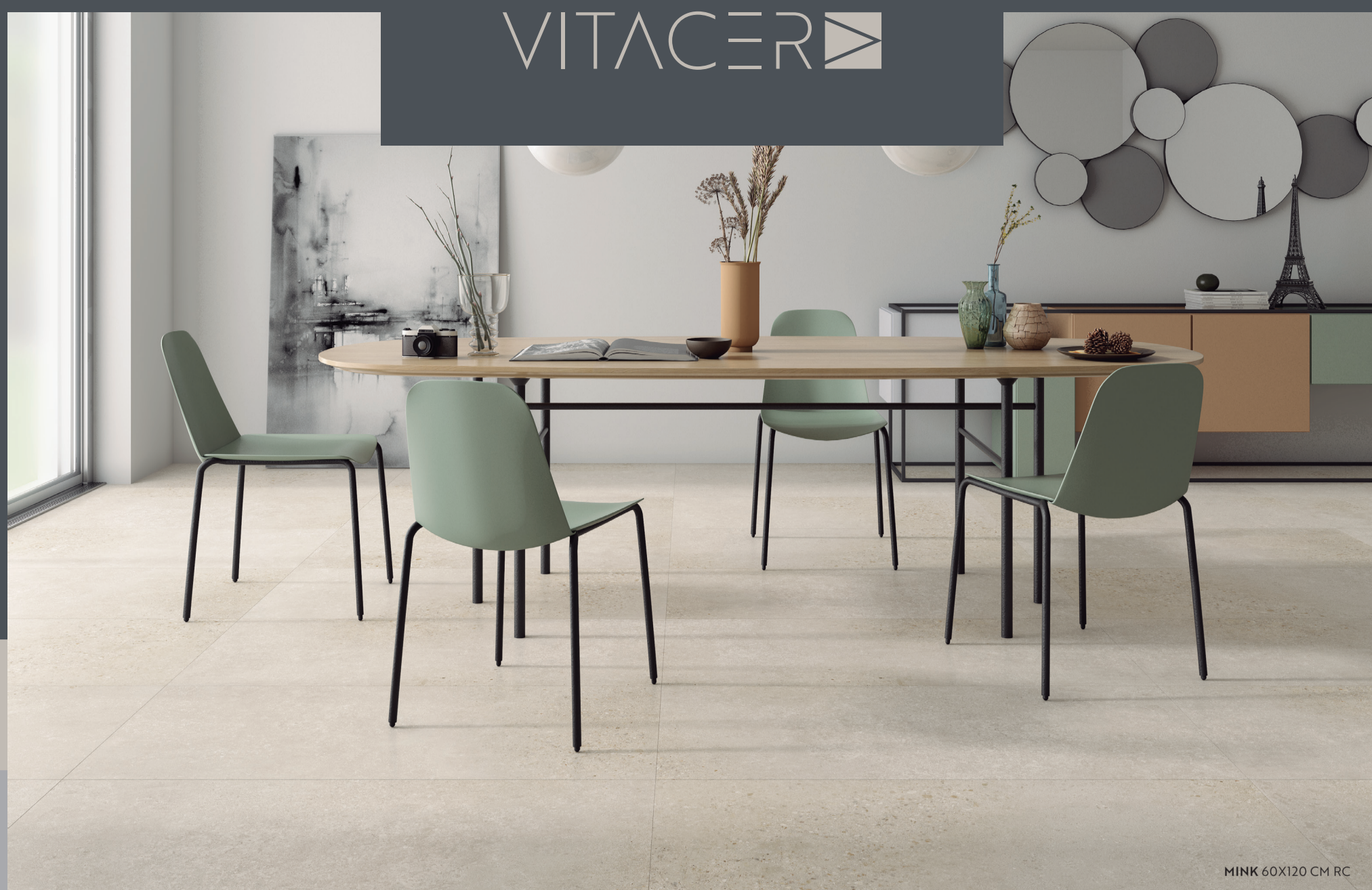
MINK 60X120 CM RC