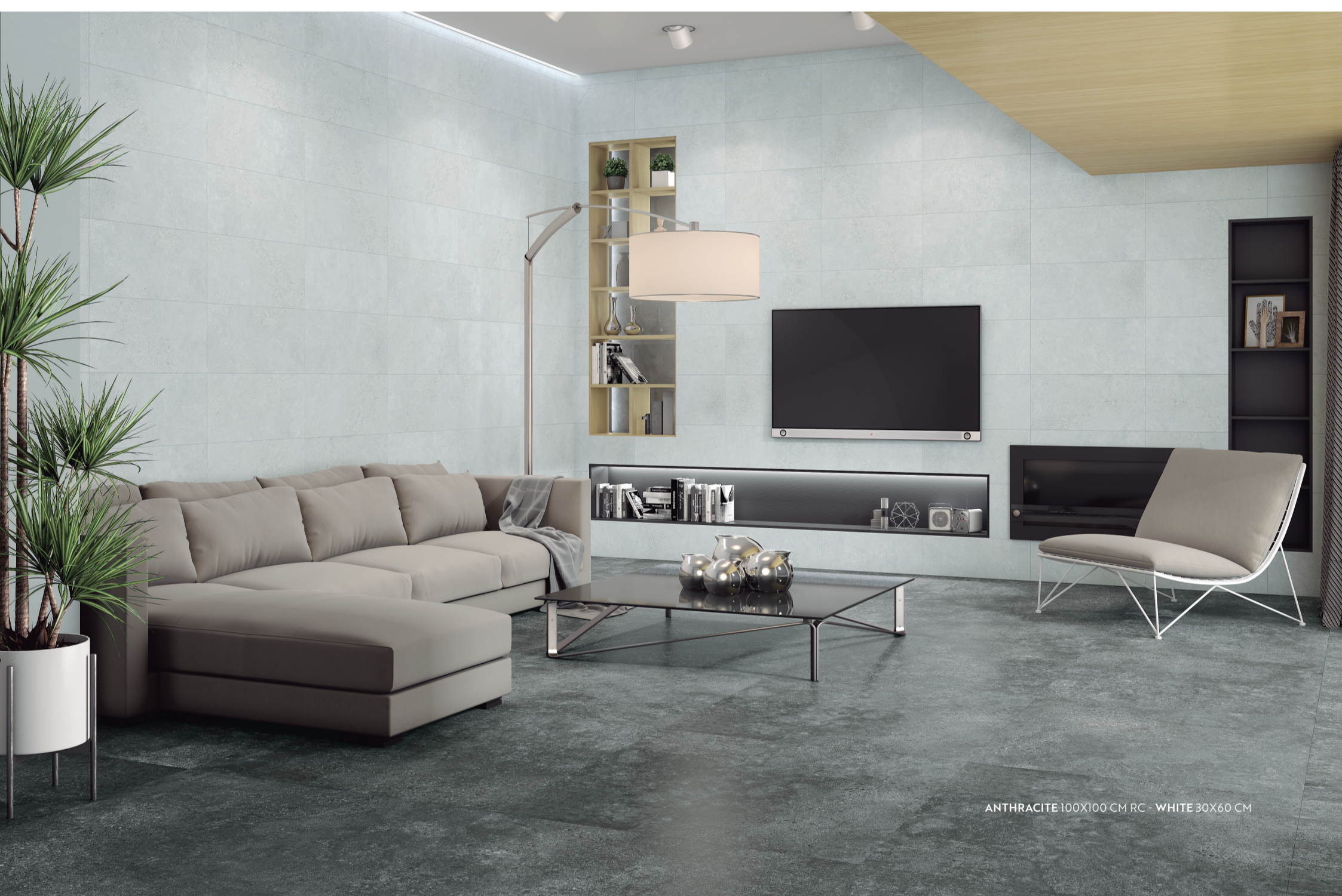
ANTHRACITE 100X100 CM RC - WHITE 30X60 CM