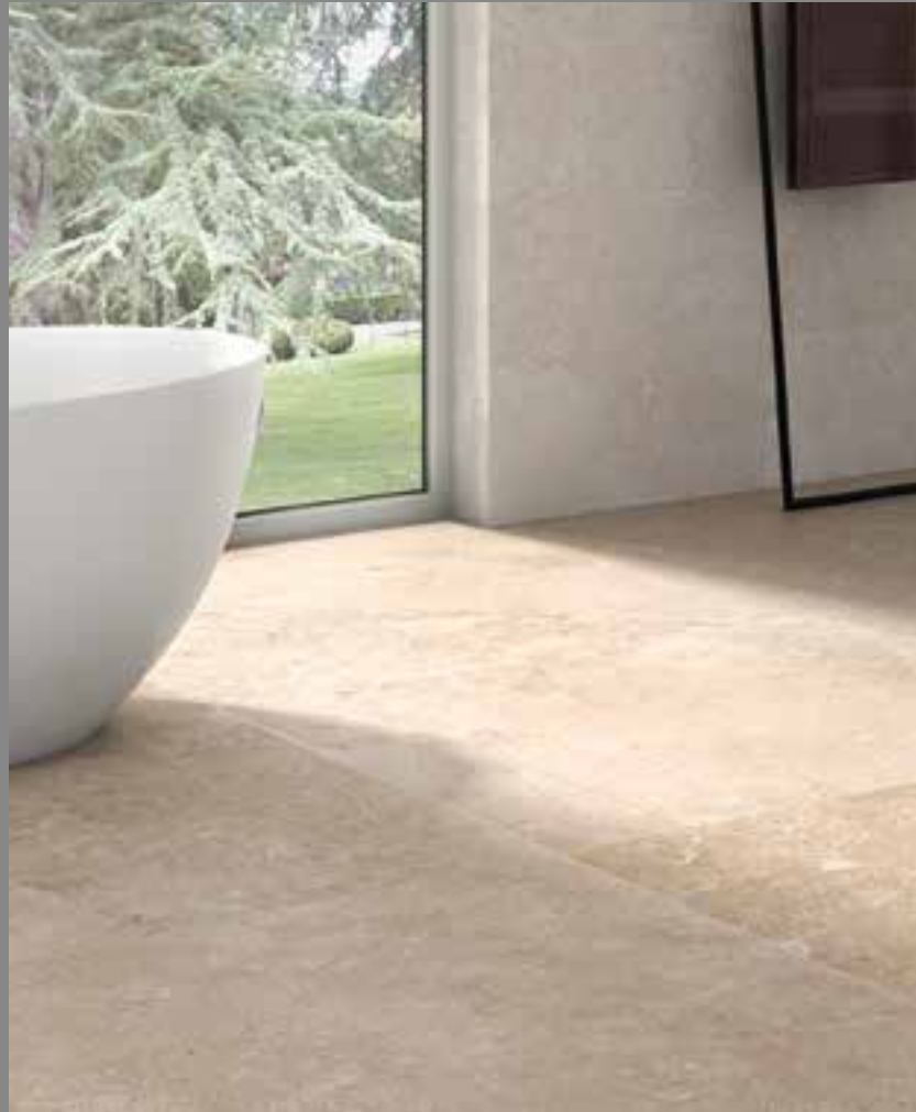
STONE 100X100 CM RC - MINK 30X60 CM